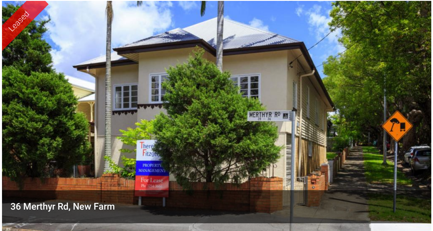
36 Merthyr Rd, New Farm