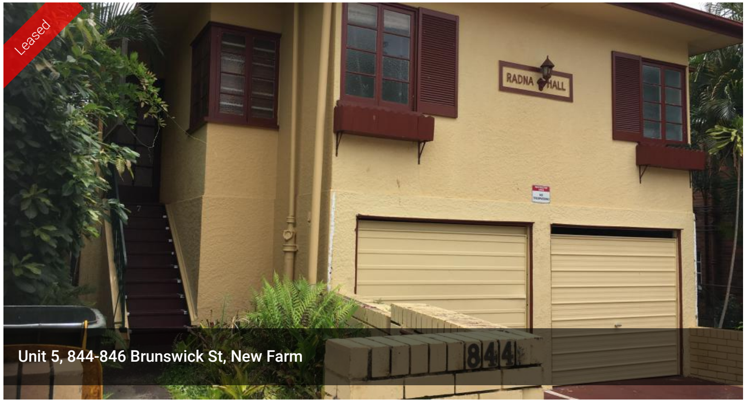
Unit 5, 844-846 Brunswick St, New Farm