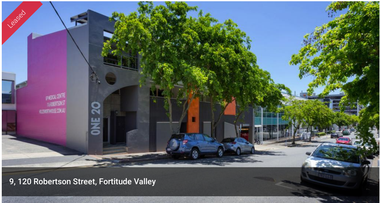
9, 120 Robertson Street, Fortitude Valley