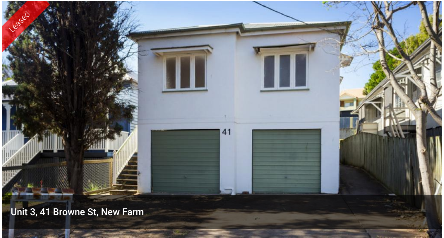
Unit 3, 41 Browne St, New Farm